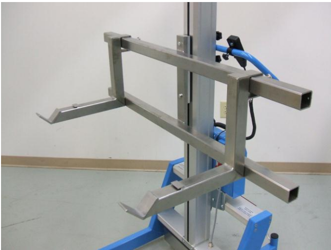
Adjustable Forks w/"V" Block-Open