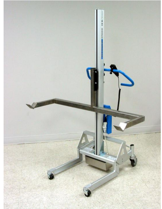
Fixed Forks w/"V" Block