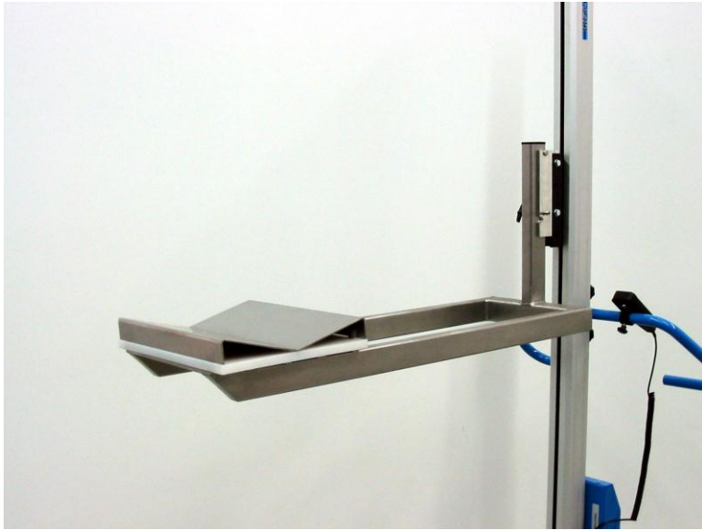
Extended Fixed Forks w/Rotating "V" Block