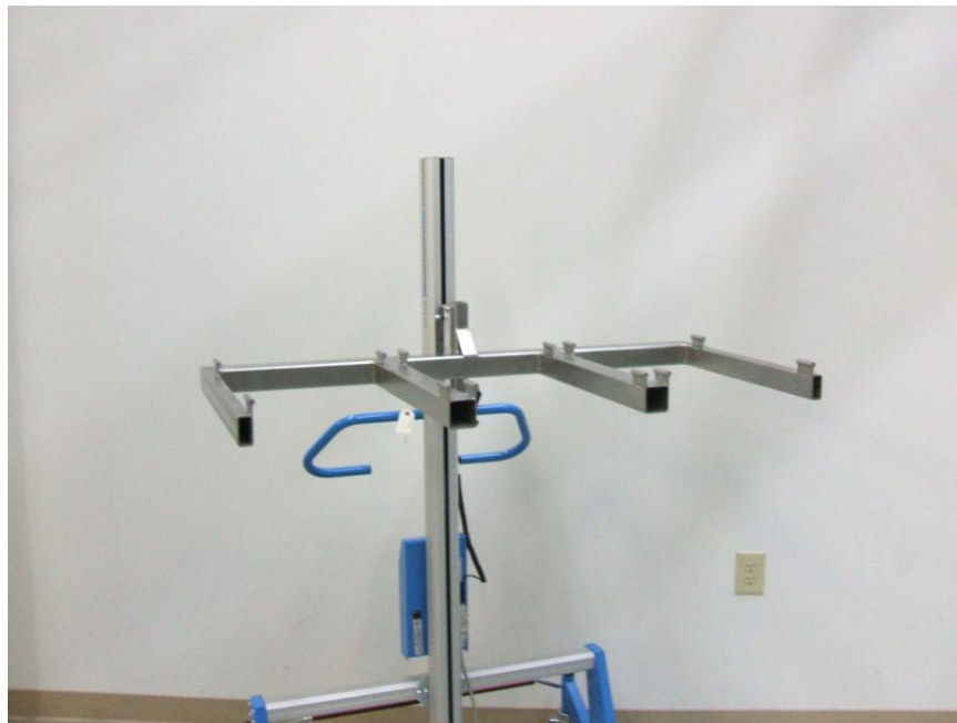
Custom Fixed Forks for Tote Handling