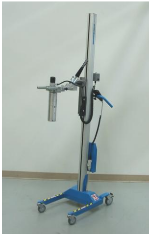
EXPAND-O-TURN® 120E Series-Maximum Weight 60-lbs 200E Series-Maximum Weight 150-lbs