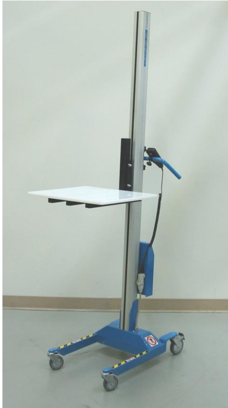
Platform 120S Series-Maximum Weight 120-lbs 200S Series-Maximum Weight 200-lbs