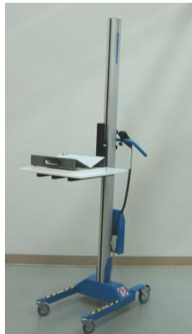
Platform with "V" Block and Turntable 120V Series-Maximum Weight 90-lbs 200V Series-Maximum Weight 180-lbs

The LIFT-N-GO™120/200 series lifters provide an economical, safe, efficient, and ergonomic material handling solution to assist you with your production needs.