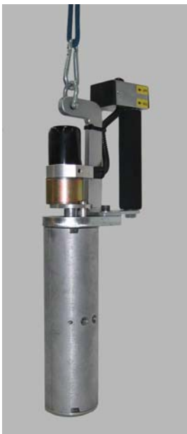
Roll Handling Electric Expand Vertical Lift/Lower