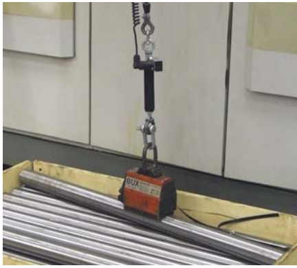
Magnetic Lifting Bar Stock