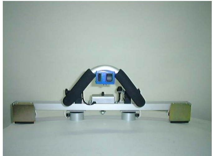
Magnetic Lifting Sheet Stock